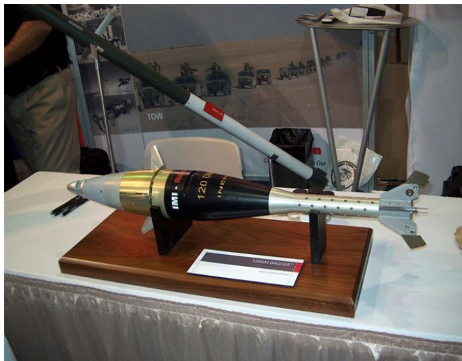
81mm or 120mm mortar round ???