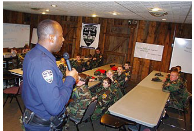
"Youth Drug Demand Reduction." (DDR) Class